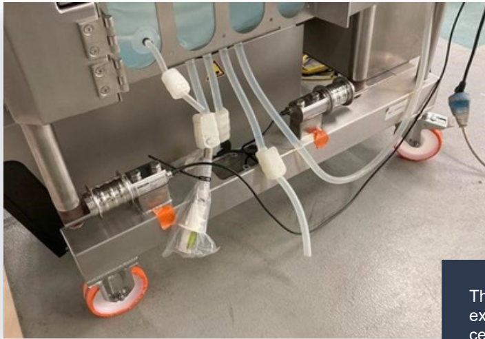
The mobile tote after existing strain gage load cells were replaced with Eilersen capacitive load cells.

For the first test, an empty tote was calibrated and validated. A 200L single use bag was installed and the tote was zeroed. The tote was then filled with water to resemble the approximate full working weight of the tote. Before starting the test, the load indication was noted. During the test, the tote was pushed through a room, stopped, and pushed around a corner and the results were measured with a resolution of 10 grams. The experience of the biopharma manufacturer was that such movements would often result in a measured difference exceeding 5kg when using strain gauge load cells if the transport locks were not engaged.