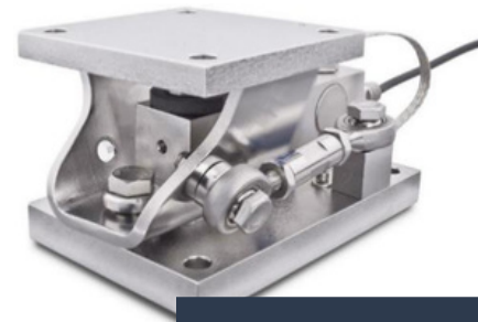
Example of strain gage load cells with side- and overload protection.

To overcome these challenges, the biopharma manufacturer installed a mechanical “transport lock” by each strain gage load cell to protect the load cell from the impact of bumps and sloshing liquids whenever the tote was moved around the facility. For this system to work properly, the daily operators would have to manually engage and disengage the brackets before and after moving the tote. In practice this action was frequently forgotten, causing deviations, and requiring recalibration of the weighing systems. To solve this important issue, the biopharma manufacturer approached the Belgian mechanical and electrotechnical engineering firm, specializing in the design and production of parts for pharmaceutical companies.