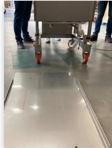
Aluminum plate Thickness: ~3 mm

After rolling over the aluminum and wooden plates of 3 and 4 mm, the weighing indicator cells displayed a variation of between 0.010% and 0.020% of full-scale after impact without utilizing lockouts or any protective devices. These results were within the MPE (Maximum Permissible Error) requirements of the biopharma manufacturer.