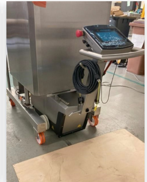
Wooden plate Thickness: ~4 mm