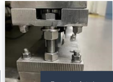
Example of strain gage load cell mounted with transport lock.